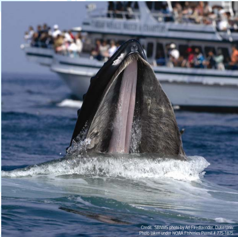
Credit: SBNMS photo by Ari Firedlaender, Duke Univ. Photo taken under NOAA Fisheries Permit # 775-1875.

Studies also indicate that humpbacks not only breed and calve in the Greater Antilles (Cuba, Hispaniola, Puerto Rico), but along the Lesser Antilles chain to as far as Trinidad and Tobago, and Venezuela, although the most populous area is along the northern coast of the Dominican Republic. The sanctuary is working with its counterpart there to coordinate education, outreach and research programs. Efforts in the Caribbean to establish sanctuaries in the Dutch and French Antilles may extend protections at the whale's migratory route endpoints.