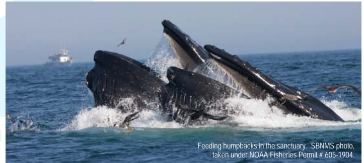
Feeding humpbacks in the sanctuary. SBNMS photo, taken under NOAA Fisheries Permit # 605-1904.

The study delineated four distinct feeding aggregations: Gulf of Maine, eastern Canada (Gulf of St. Lawrence, Labrador and Newfoundland), West Greenland, and eastern North Atlantic (five groups, if you separate the Iceland and Norway populations). All of the western Atlantic feeding groups traveled to the West Indies to mate and calve. Surprisingly, some Norway whales, once thought to migrate only to the Cape Verde Islands, were found in the Caribbean.